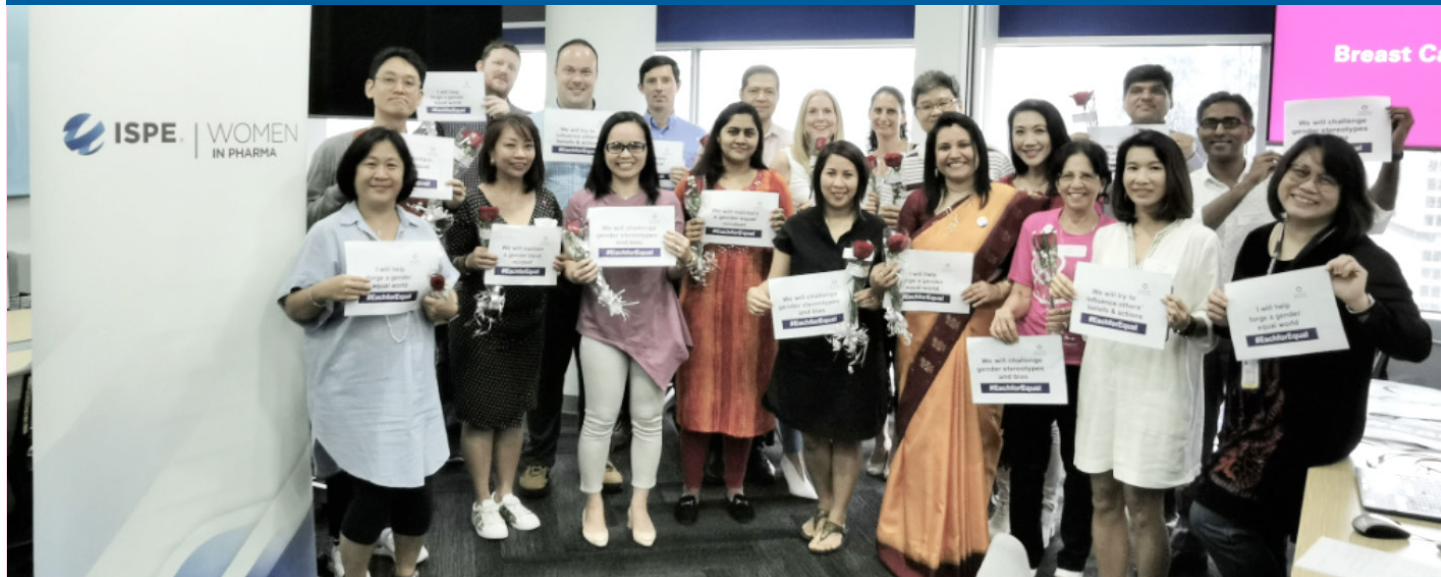
On 7 March 2020, in celebration of International Women's Day, the ISPE Singapore Affiliate's WIP team held a talk on breast cancer awareness. Read more...

News and Information for ISPE Chapter and Affiliate Women in Pharma® Leaders